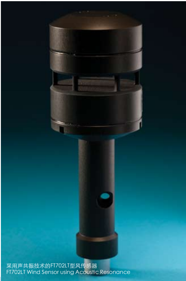
采用声共振技术的FT702LT型风传感器 FT702LT Wind Sensor using Acoustic Resonance

每个转换器一次只能转换一个超声信号。信号从转换器朝外穿行直至撞到上反射器，经其反射至下反射器，再被下反射器反射。此后，超声在上下反射器之间不断反弹，直到释放所有能量，这个过程需要约200次反射。